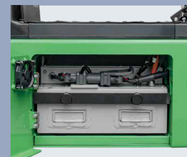
Lithium battery pack