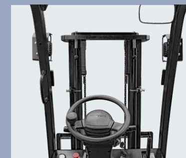
Wide view mast

/ The optimized design of the wide-view mast and the low dashboard enable a wide front view and higher safety, and minimizes the blind view to the greatest extent. / The emergency power-off switch complies with European safety standards. / The electronic and hydraulic overload protection comply with safety regulations. / OPS system(Opt.) can improve safety greatly.