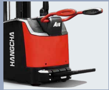
The integrated stamping molded guardrail offers better protection for the operator