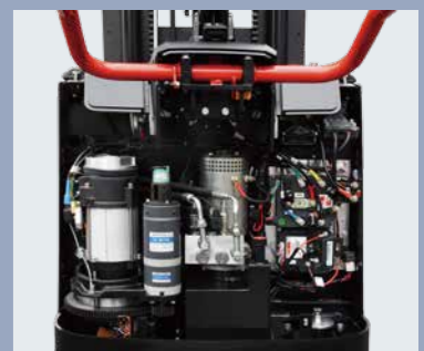
Back cover can be opened fully, and all components and parts are clear at a glance, which is very convenient for maintenance of the entire machine