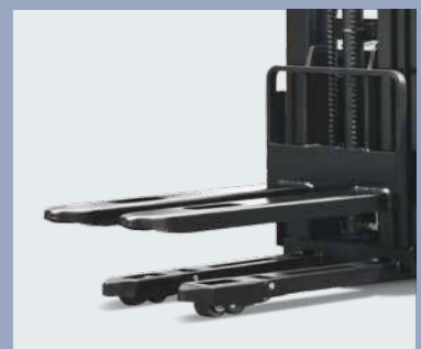
Tandem load wheel